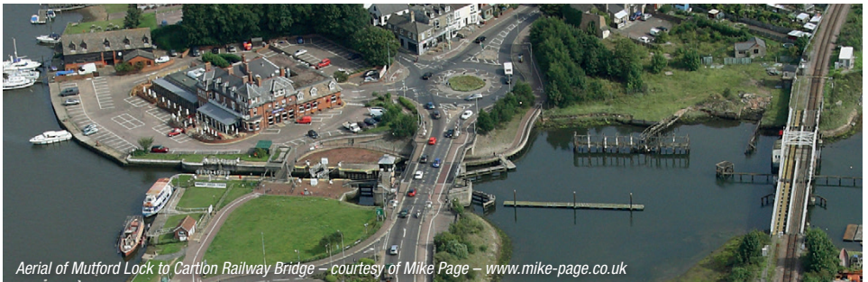
Aerial of Mutford Lock to Carlton Railway Bridge