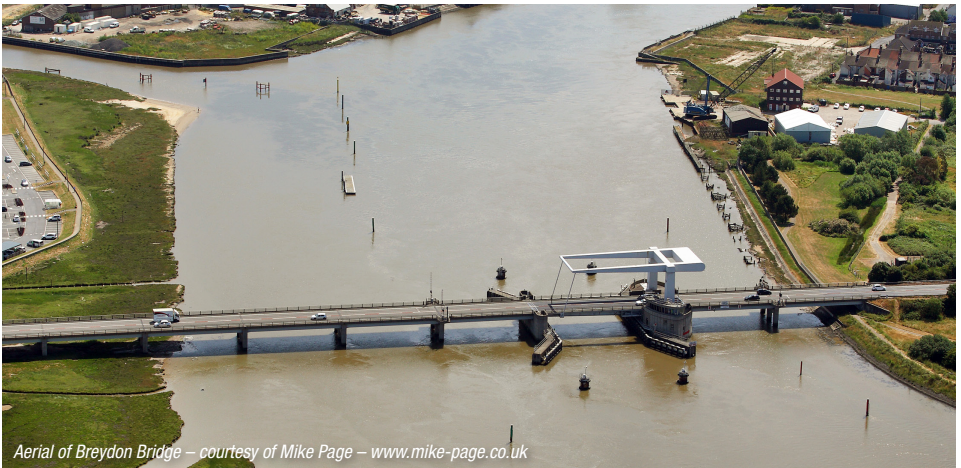
Aerial of Breydon Bridge